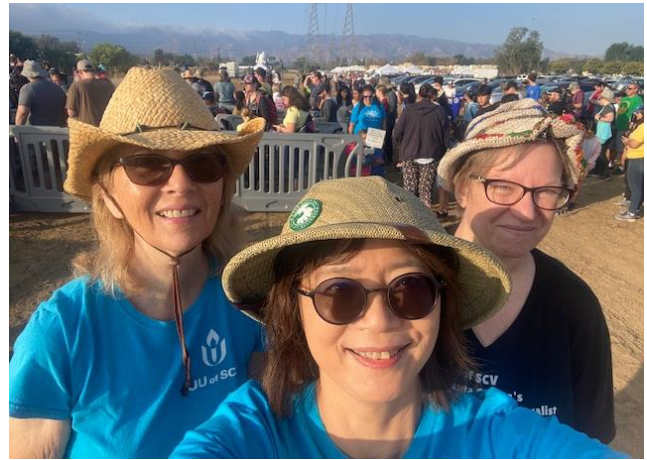
UUSCV Members at 2022 River Rally

To participate you must pre-register at santaclaritavolunteers.com . Wear closed toed shoes, appropriate clothing for picking up debris, sunscreen, a hat, and bring a refillable water bottle to stay hydrated. You will be given gloves and bags. There is an Environmental Expo in the community center where you can get valuable tips on conservation, pollution prevention, and recycling with nearly two dozen booths.