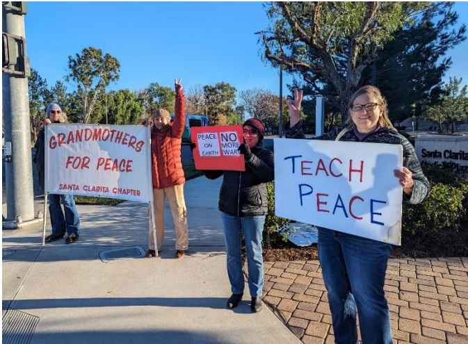
January 7, 2024

Grandmothers (and Others) for Peace – Grandmothers (and Others) for Peace meets on the first Sunday of the month from 3 to 4 pm at Valencia and McBean (on the Facey corner.) There are usually signs provided or you can bring your own.